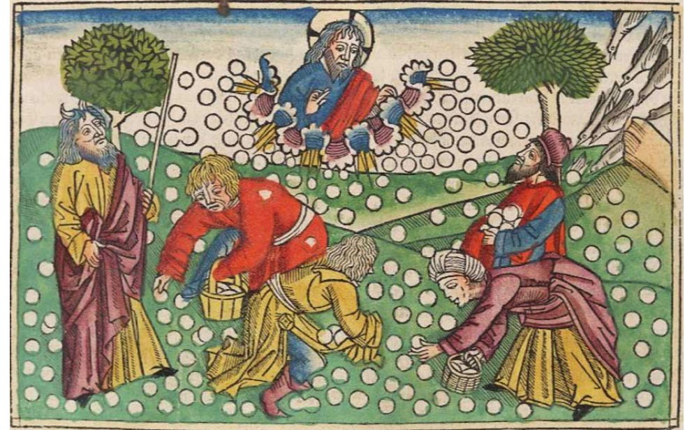
Illustration from the Nuremberg Bible, 15 th C.